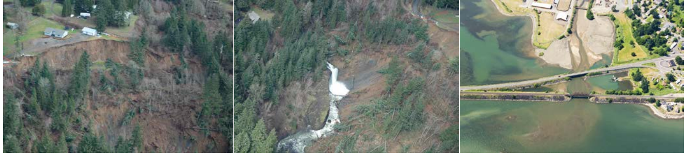
Rock Creek Reach 2 Degradation & Restoration Opportunities Scarp of Piper Road Landslide at Rock Creek’s First Falls & resulting aggradation in Lower Rock Creek.