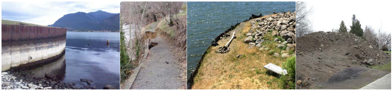
Columbia River Reach 2 Degradation & Restoration Opportunities Sheetpile, active erosion, and staging along the Port of Skamania's Stevenson Shoreline Restoration & Enhancement Project