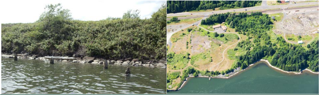
Columbia River Reach 3 Degradation & Restoration Opportunities

Derelict piles, riprap slopes & invasive species on the SR 14/BNSF rail road berm. Former industrial development.