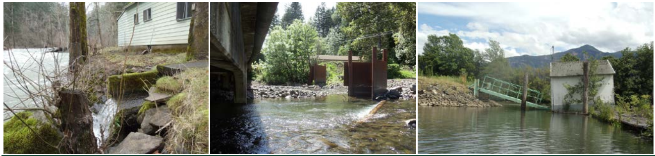
Figure 4.4-3 Potential Restoration Opportunities, Rock Creek Reach 1

Untreated stormwater outfall & abandoned residence. Rock Creek Drive bridge & protective pilings. Abandoned tug boat dock.