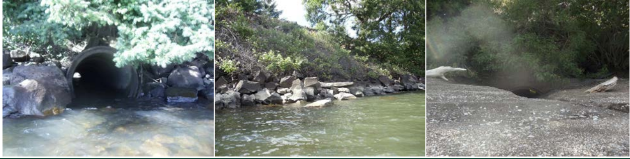
Columbia River Reach 1 Degradation & Restoration Opportunities Differing culvert sizes & elevations, Riprap slopes, and Invasive species along the SR 14/BNSF railroad berm

The degraded areas and restoration opportunities identified in this reach include: