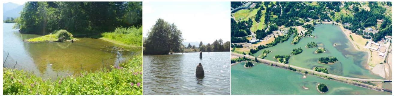
Rock Cove Degradation & Restoration Opportunities Pilings, fences, & dredge basins provide visible relics of Rock Cove’s industrial past.