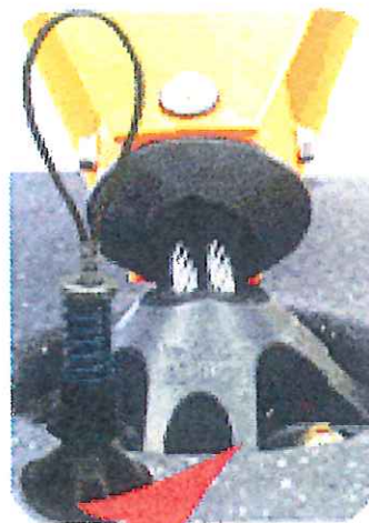
Illustration of Spring Design