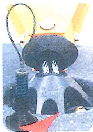
Illustration of Spring Design